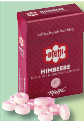
pfeffi Raspberry Mint Drops 35g Flip Top Box 10 pcs. in a display Order No. 300021