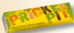
PRICKEL PIT Bars Special Edition Multifruit