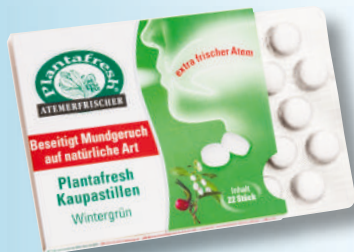
Plantafresh Wintergreen Based on wintergreen and bloodroot