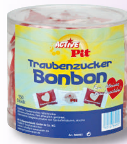
Individually packed in heart foil