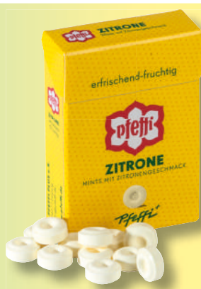
pfeffi Lemon Mint Drops 35g Flip Top Box 10 pcs. in a display Order No. 300022