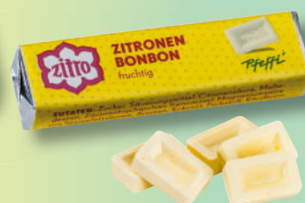
Zitro lemon candy Bars 10g each bar 100 bars in a display Order No. 300003