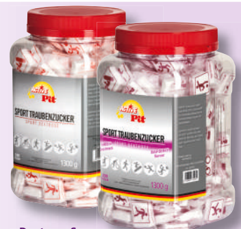
Dextrose Squares individually packed varieties: lemon and raspberry

Active Pit Raspberry small Dextrose Candies 35g in a Flip Top Box 10 pcs. in a display 15 displays in a carton Order No. 500022