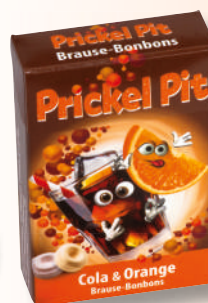
Effervescent Candies with the classic Prickel Pit recipe. In lozenge form.