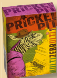
PRICKEL PIT Special Edition Candies Multifruit