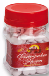
Pineapple and raspberry