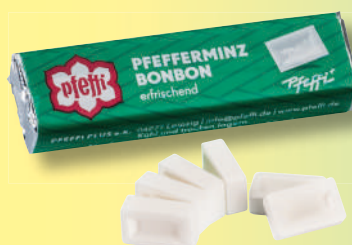
Pfeffi peppermint candy Bars 10g each bar 100 bars in a display Order No. 300001