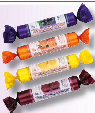
In 20 different varieties