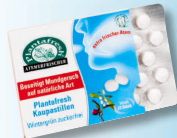
Plantafresh classic sugar-free Based on wintergreen and bloodroot