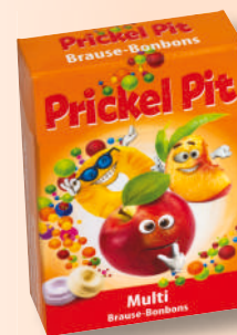
Effervescent Candies with the classic Prickel Pit recipe. In lozenge form.

Prickel Pit Lemon Bars 50 pcs. in a tray