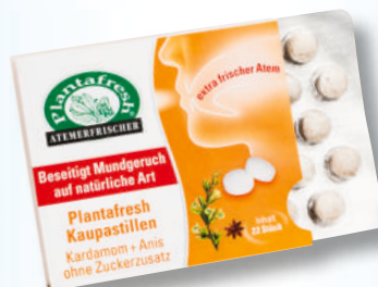
Plantafresh cardamom and anise sugar-free